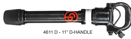
4611 D - 11" D-HANDLE