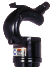
Open grip handle