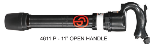
4611 P - 11" OPEN HANDLE