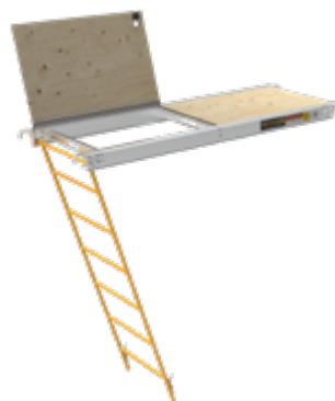
PLATFORM WITH TRAPDOOR AND LADDER