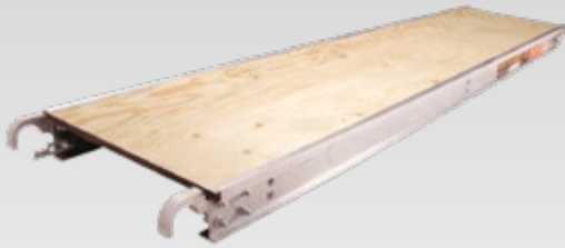
ALUMINUM PLATFORM WITH 5/8" PLYWOOD DECK