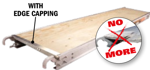
WITH EDGE CAPPING